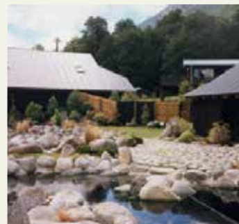
Natural mineral hot pools