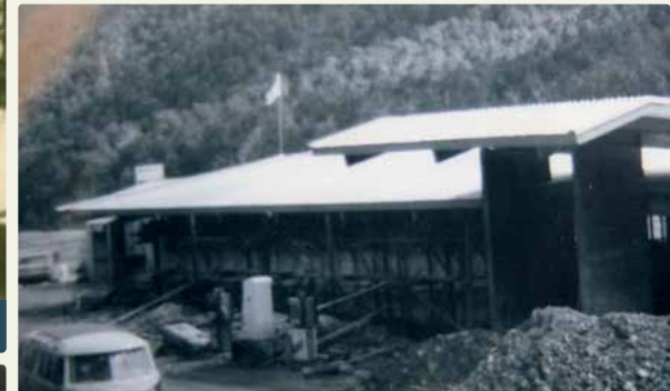
1970's rebuilt as a pub