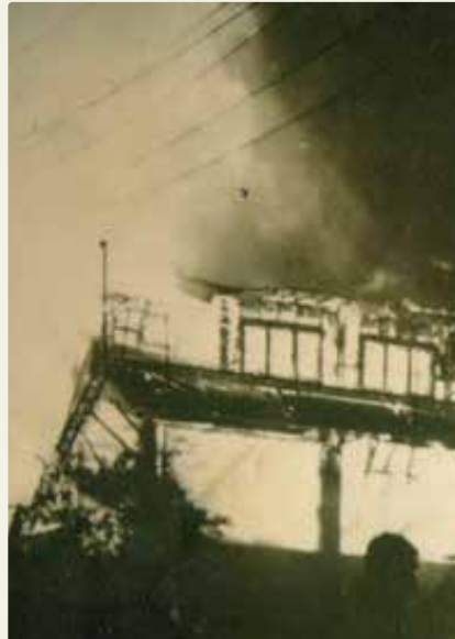
1968 destroyed by fire