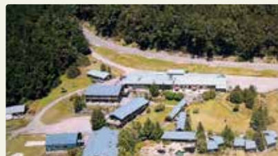
1980's pub with swimming pool