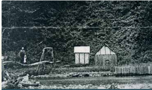
Early 1920's bathing huts