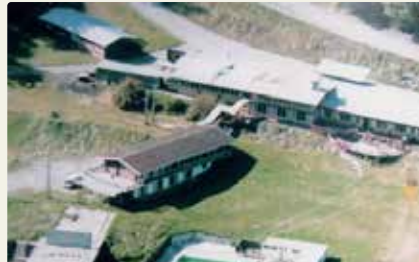
1950's easy access