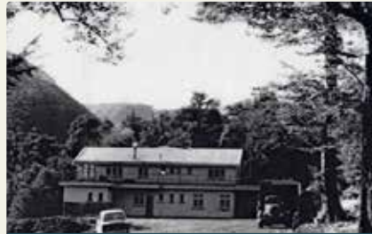
1940's a grand chalet