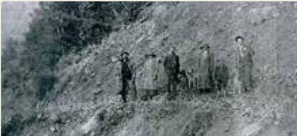
Lewis Pass before road was built