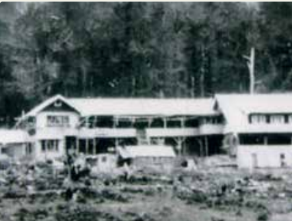
1940's a grand chalet